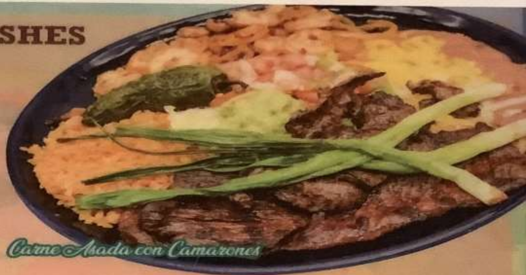
Carne Asada con Camarones

WHOLE TILAPIA Served with rice, beans and a salad. 13.95